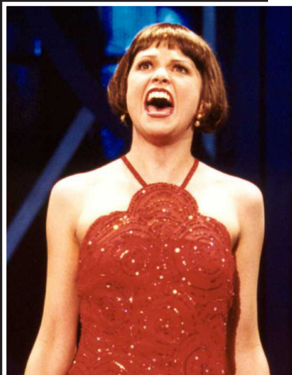
Sutton Foster as Millie on Broadway